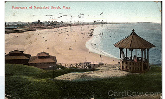
gazebo on Atlantic Hill, Nantasket Beach