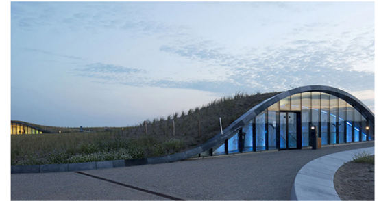
Katwijk dune carpark pedestrian entrance