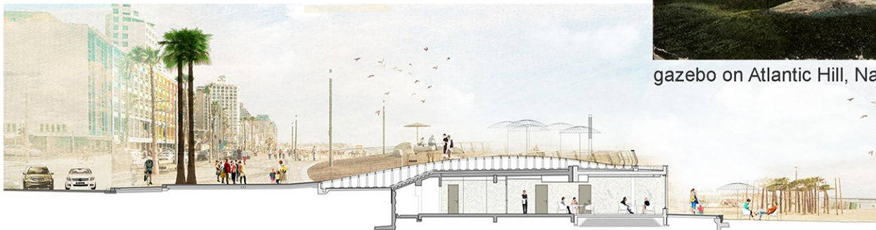
Tel Aviv, Israel Central Promenade - cross-section of beach covered structures