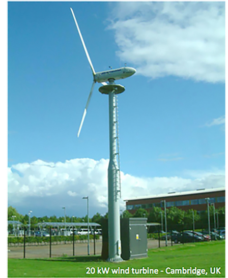
20 kW wind turbine - Cambridge, UK