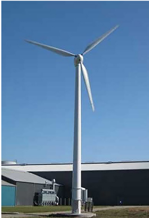
40' tall wind turbine