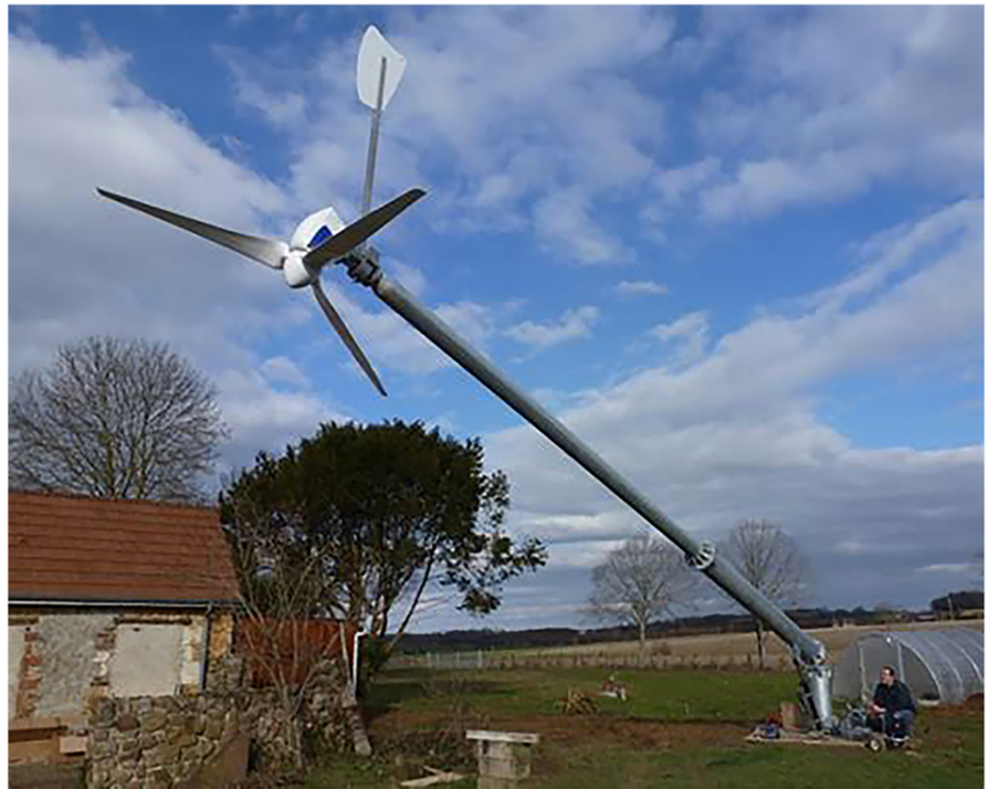
Turbine lowered for maintenance or repair